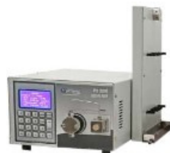
HPLC Column Washing Pump (4 Columns)