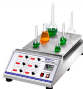
Multipoint Stirrer with hot plate