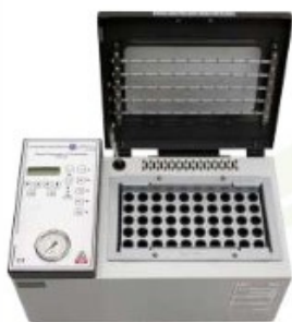
Nitrogen Evaporator 50/ 25/108 Samples