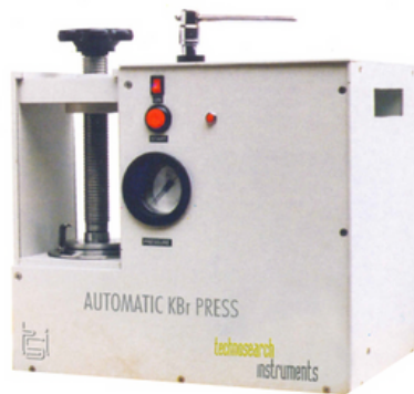
KBR Press (Automatic)