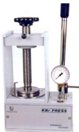
KBR Press (Manual)