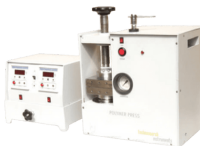
Polymer press (Manual/ Automatic - 15/30 TON)