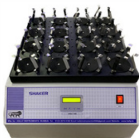
Open air Orbital/ Reciprocating Shaker