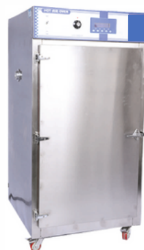
Hot Air Oven